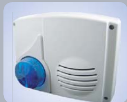
Outdoor Siren/Strobe - Improve police response and deterrence