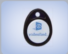
Badge - Proximity Arming Tag