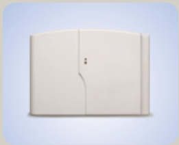
Indoor Siren - Increase deterrence with additional sirens