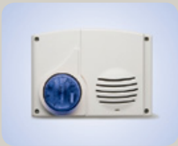
Outdoor Siren/Strobe - Improve police response and deterrence