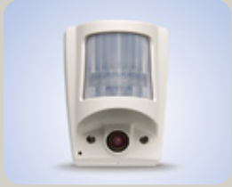
Indoor MotionViewer - Additional security where you need it

Add up to 20 devices to customise your system