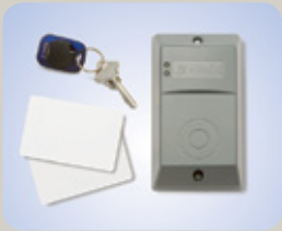
Outdoor Prox-Tag Reader - Disarm the system before entering the building