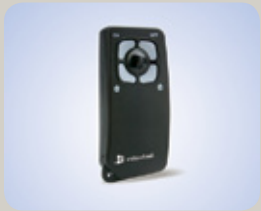
Remote Control - Battery powered remote arming