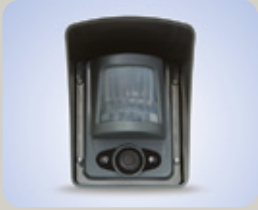
Outdoor MotionViewer - Secure detached garages, porches, patios and storage sheds