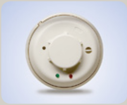
Smoke Detector - Additional protection for family and valuables